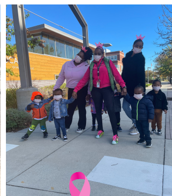
2021 Breast Cancer Awareness Walk