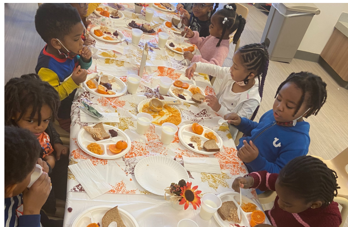
2021 Class Thanksgiving Lunch!